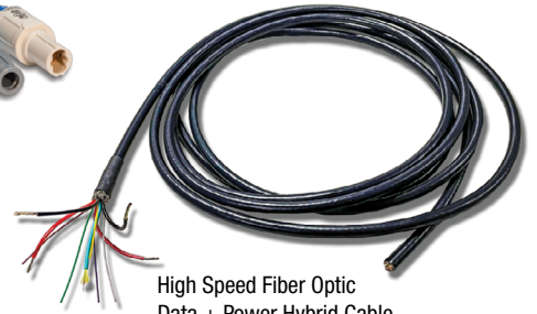
High Speed Fiber Optic Data + Power Hybrid Cable