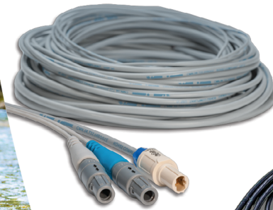
BioCompatc ® Silicone Alternative Medical Grade Cable